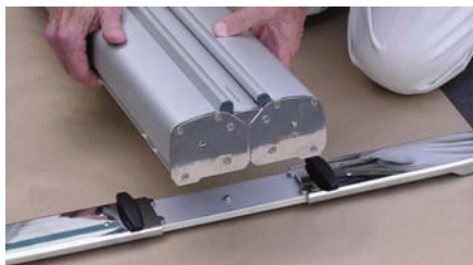
the weighted, support feet mount easily to the base, providing stability on flat surfaces such as snow, grass, sand, pavement and concrete.