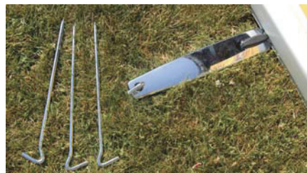
optional stakes are available for additional stabilization on soft surfaces such as snow and grass